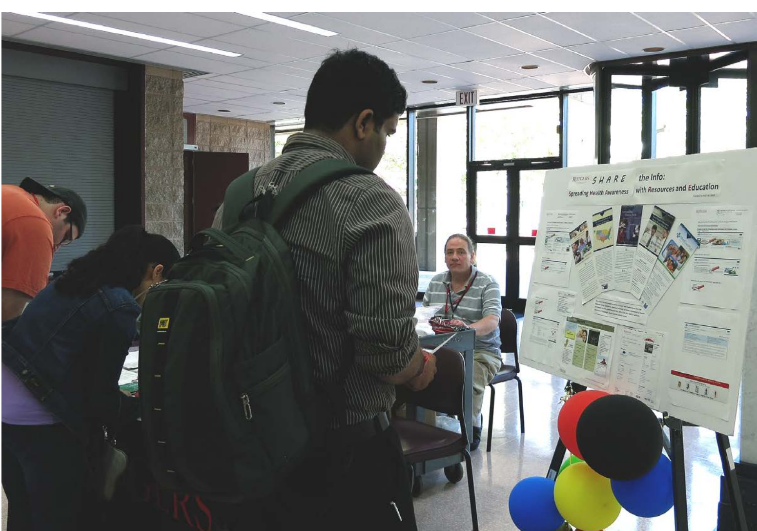
This project has been funded in whole or in part with Federal funds from the National Library of Medicine, National Institutes of Health, Department of Health and Human Services, under Contract No. HHS-N-276-2011-00003-C with the University of Pittsburgh, Health Sciences Library System.

August 2015 – October 2015 @ NJMS September 2015 – August 2016 @ UH, and RWJ Hospital