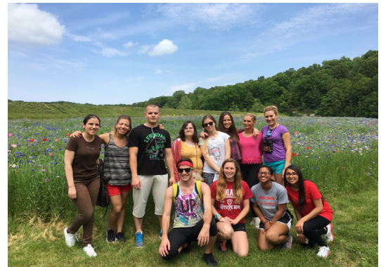
Group participants enjoy a beautiful field in Vojvodina, Serbia.