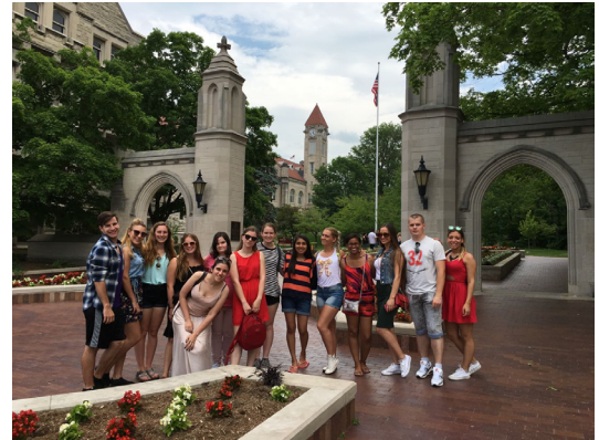
Serbian and IU group participants at the Sample Gates in Bloomington, IN

The program is scheduled to be repeated in the summer of 2017 with an expanded number of programs in Serbia with whom the IU students will work. In addition, interest both among IU students and University of Belgrade students indicates that numbers in both groups are likely to increase.